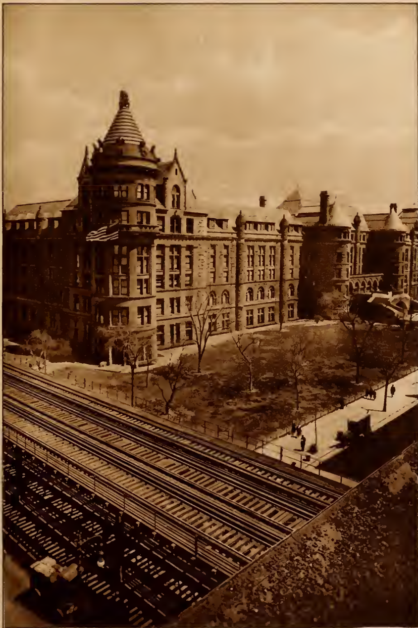
MUSEUM OF NATURAL HISTORY, Central Park West of 81st Street.